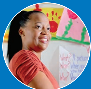
| teachers' salaries |