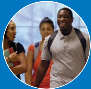
| scholarships |