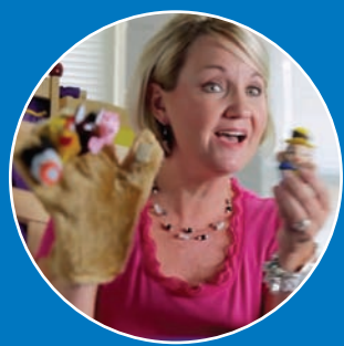
| more at four |

more at four | construction | scholarships | teachers' salaries