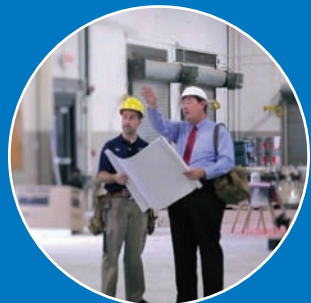
| construction |